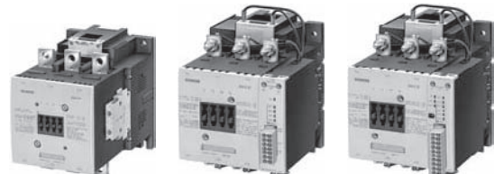
3RT10 64-6A-6 3RT10 56-6P-5 3RT10 56-6Q-5